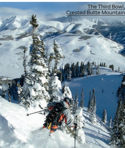
The Third Bowl, Crested Butte Mountain