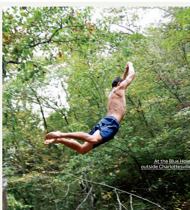
At the Blue Hole, outside Charlottesville

THE LIFE: The ’80s saw a slow and steady proliferation of singletrack outside town, making the Butte a